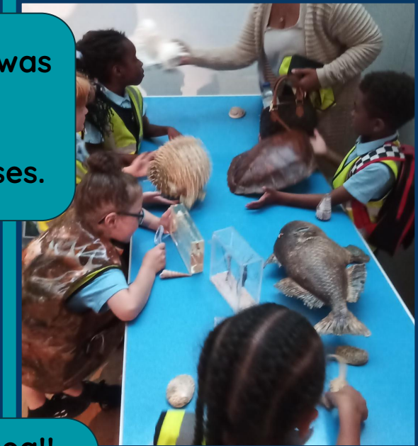
I can hear the sea!! I liked finding the seahorse and the fish!