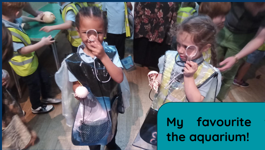
My favourite was the aquarium! I can see seahorses.