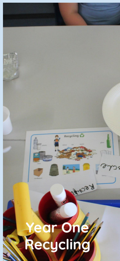
Year One Recycling