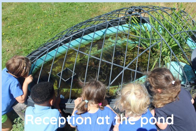
Reception at the pond