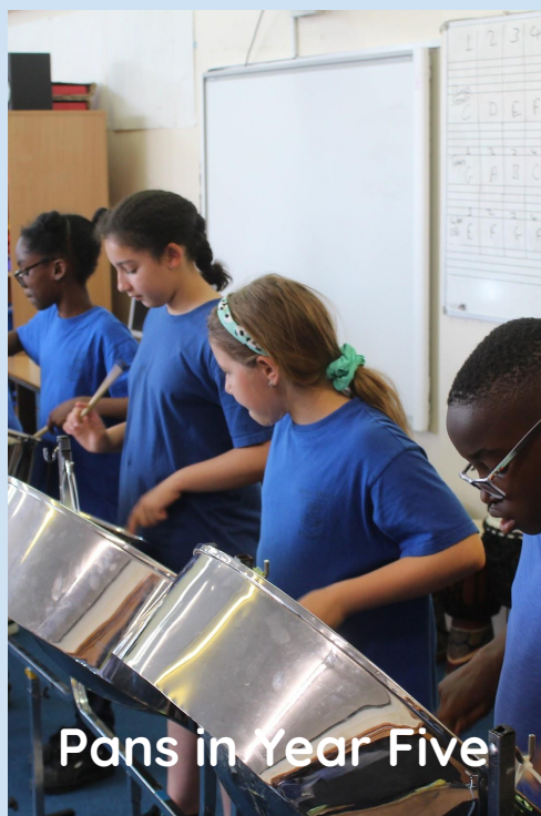
Pans in Year Five