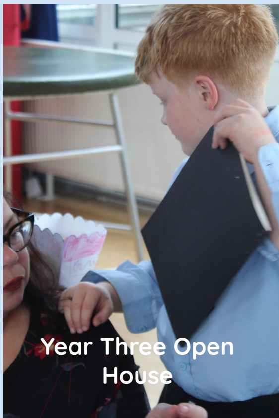
Year Three Open House