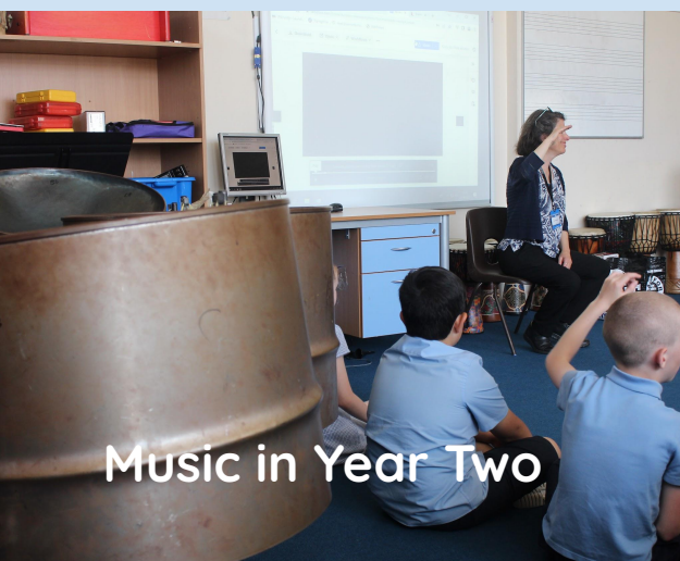
Music in Year Two