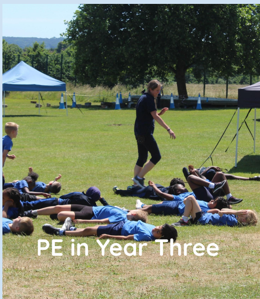
PE in Year Three