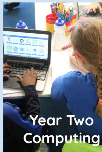
Year Two Computing