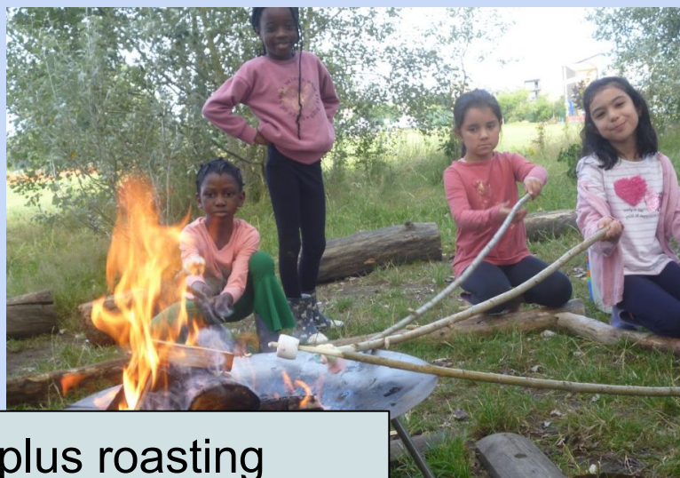
The usual fun plus roasting marshmallows and making s'mores!!