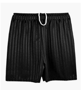
Option 1: James Dixon Active Uniform